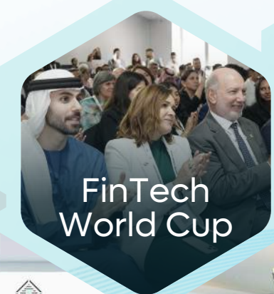
FinTech World Cup