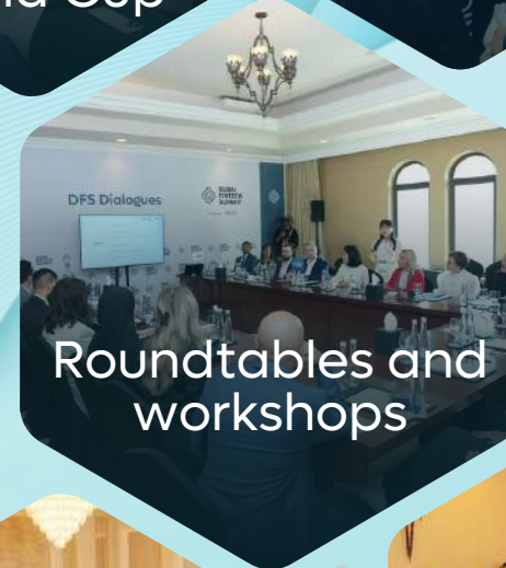
Roundtables and workshops