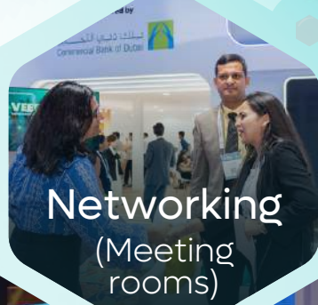
Networking (Meeting rooms)