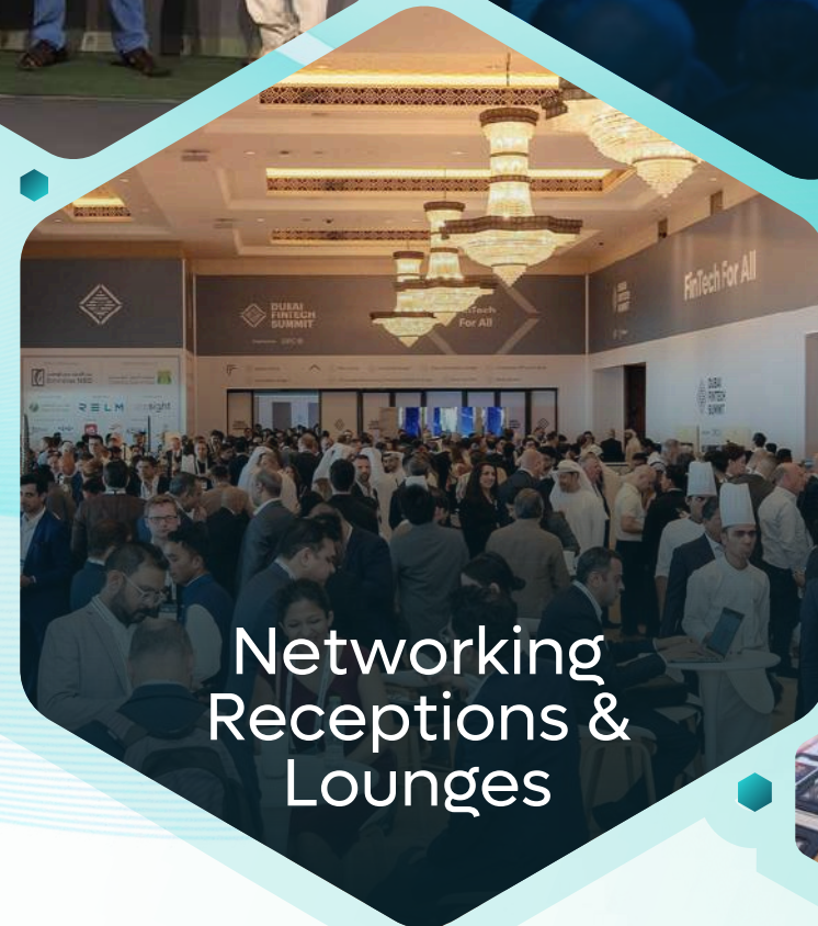
Networking Receptions & Lounges