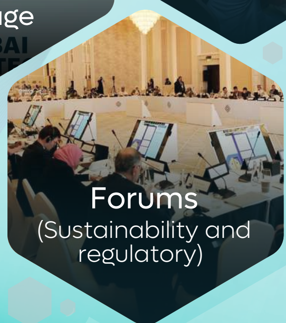
Forums (Sustainability and regulatory)